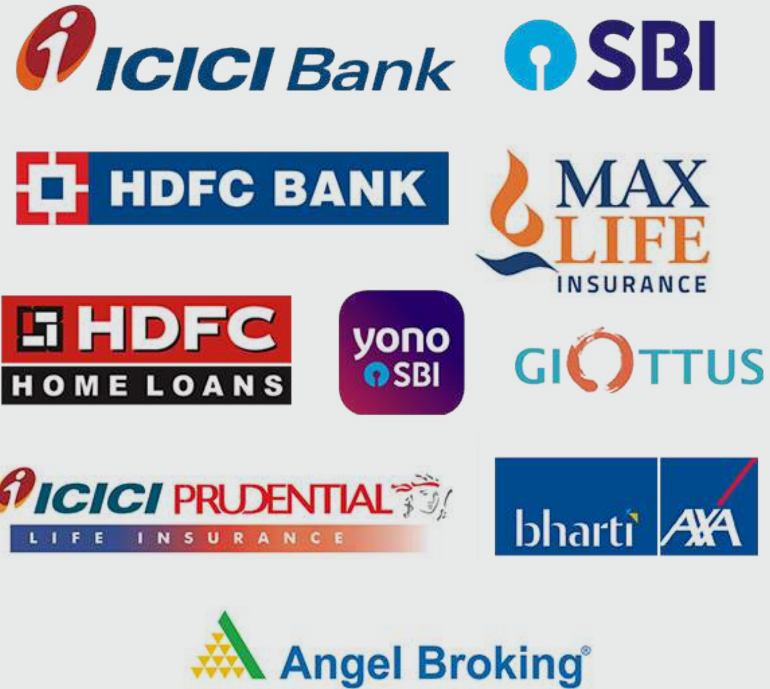
Finance & Fintech