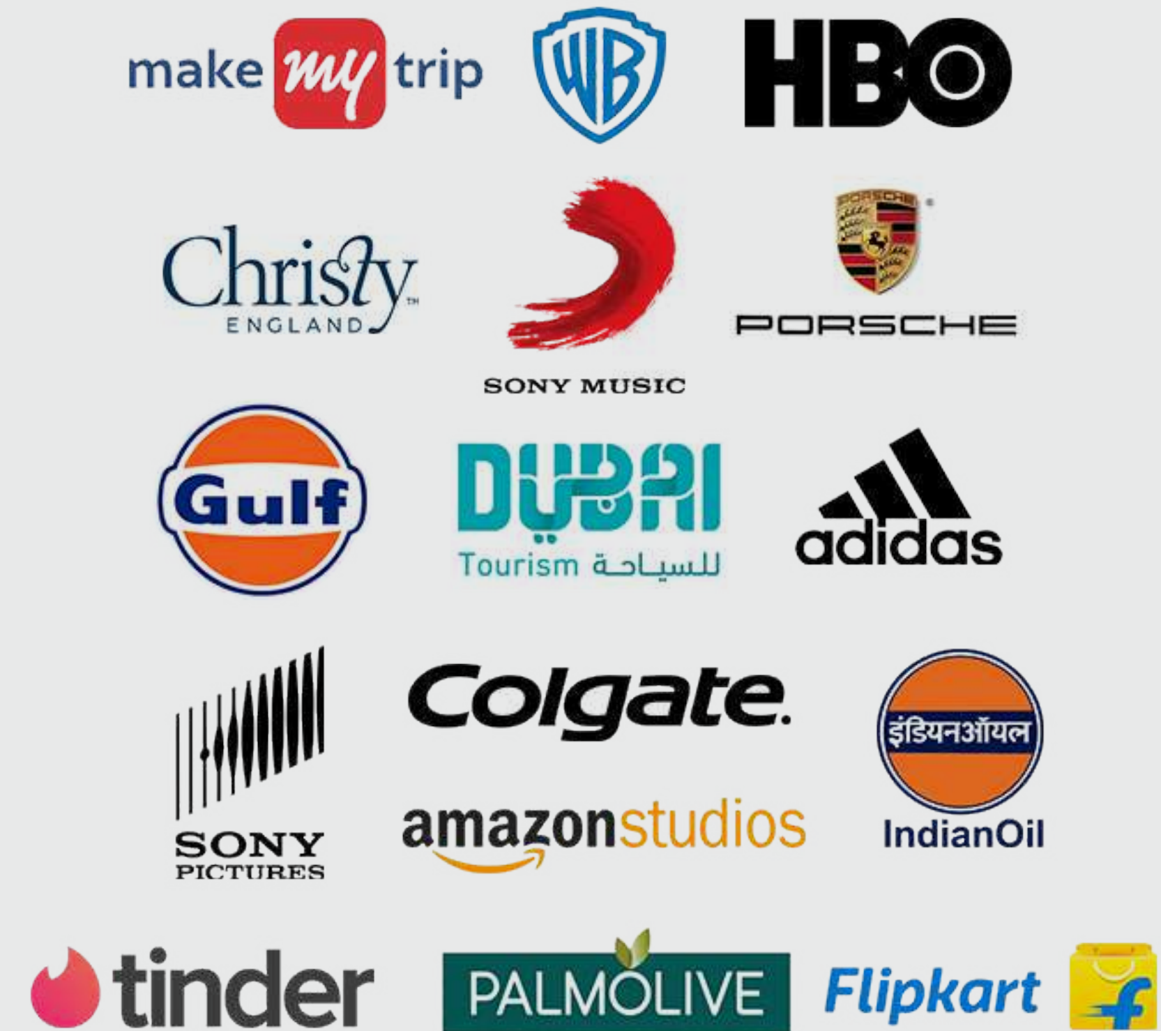
Consumer & Entertainment

We Strategise, Ideate, Innovate Script, Produce & Deliver End to End